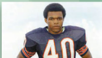
Gale Sayers, Running Back for the Chicago Bears

(Born) May 30, 1943 - (Died) September 23, 2020