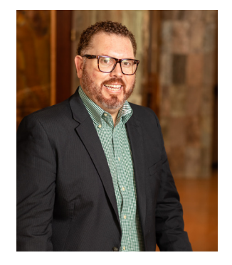
Dear St. Patrick Catholic Community,

May the Peace and Love of Jesus be with you always!